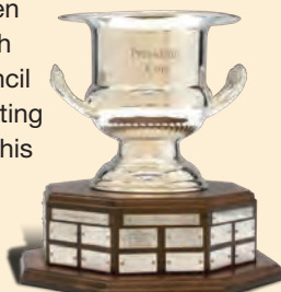
Trophy donated by Weber, Inc.

The Challenge is open to all attendees. Each will register the Council they will be representing for team pairings in this "bragging rights" tourney.